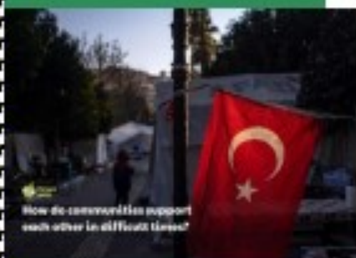
How do communities support each other in difficult times?