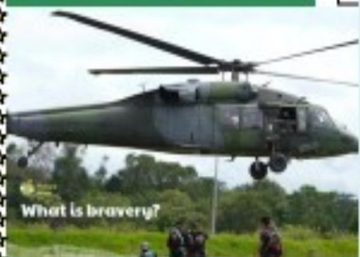
What is bravery?