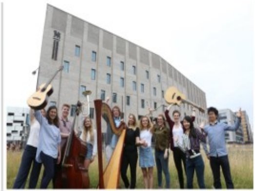
The Royal Birmingham Conservatoire

To organise a free taster harp lesson then please contact me using the information provided. All being well, socially distanced in-person harp lessons will be able to take place from the summer term. Don't worry about not having a harp already - I'll provide a harp for your lessons!