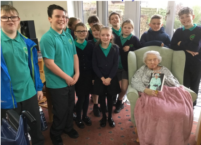
Christmas carols at the Elms