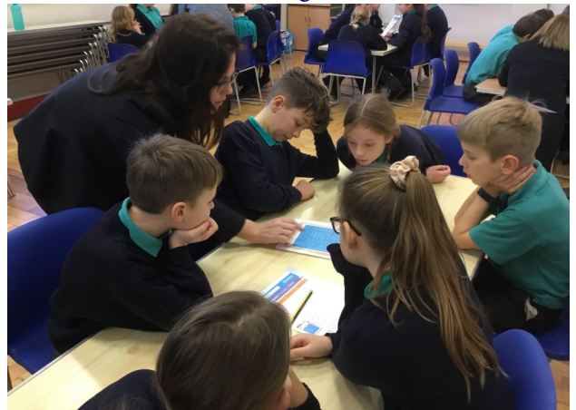
Money Sense workshop