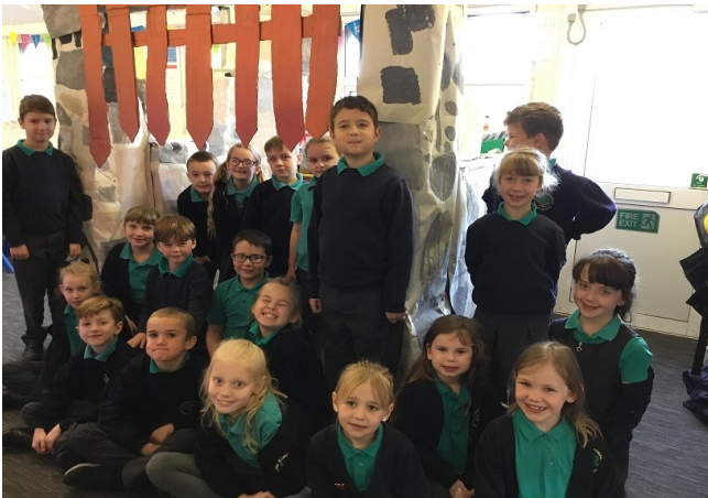
Beech class castle project